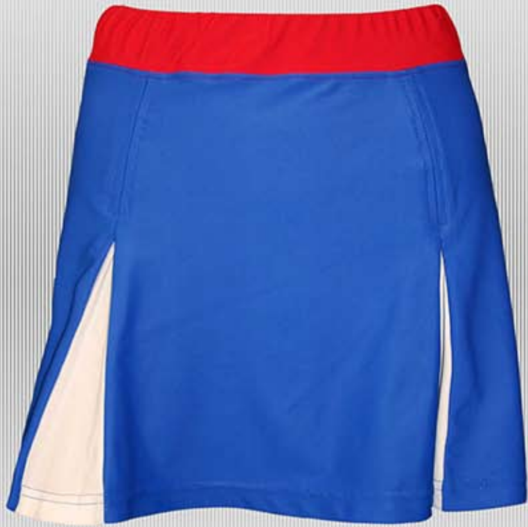
Skirt & Skort Styles